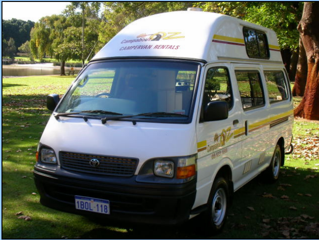
The vehicle used during our tours is the Hitop campervan